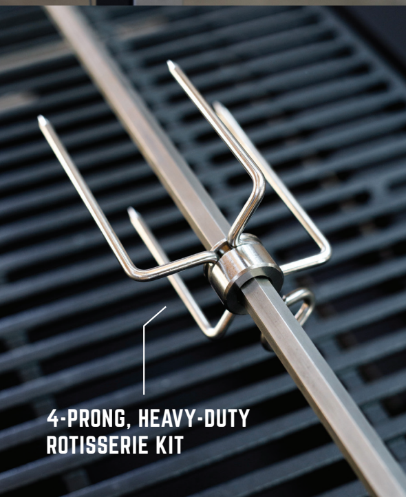
4-PRONG, HEAVY-DUTY ROTISSERIE KIT