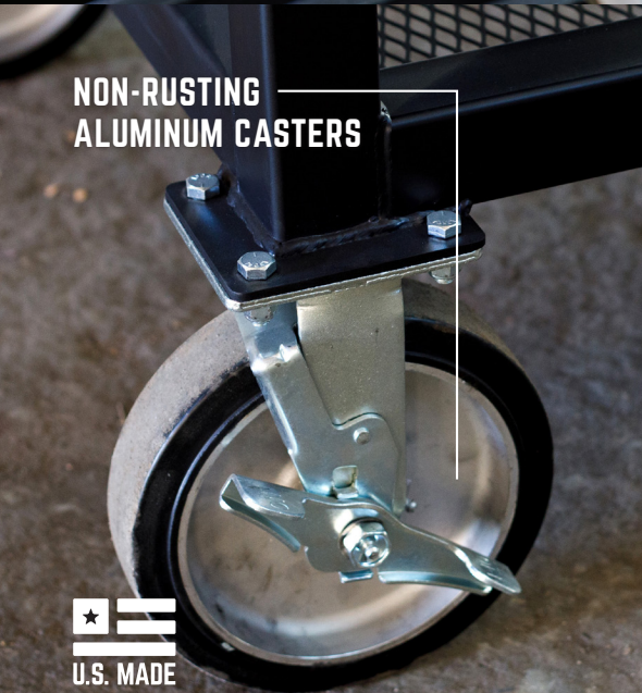
NON-RUSTING ALUMINUM CASTERS