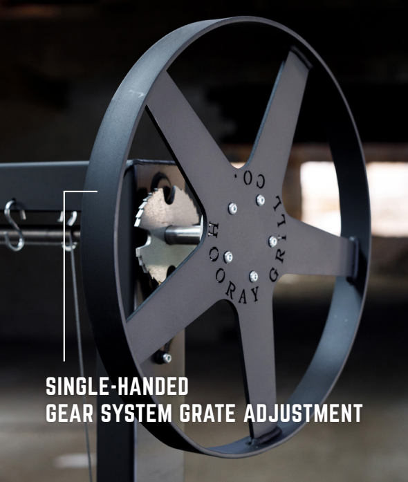
SINGLE-HANDED GEAR SYSTEM GRATE ADJUSTMENT